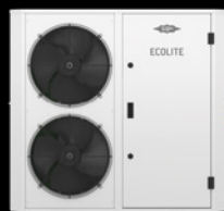
ECOLITE // LHL5E