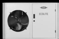
ECOLITE // LHL3E