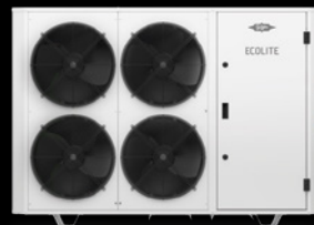
ECOLITE // LHL7E